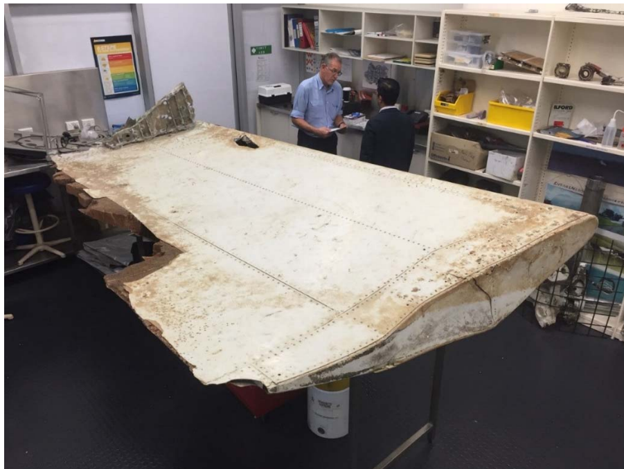
Malaysian and Australian investigators examine the piece of aircraft debris found on Pemba Island off the coast of Tanzania.